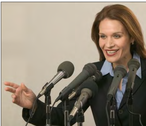
Table 12.2 Dressing Appropriately

Think of it as an interview... just like in an interview, you will want to make